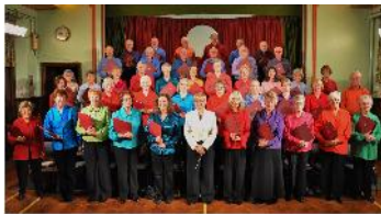
The Kemsing Singers