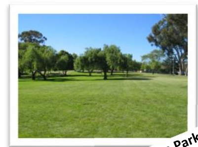
Come To The Parks!

Do you like the outdoors and adventuring in the sun set? In Otford there are many parks and grassy areas to take your pets on walks and to get you into the fresh air sprit! Well, an intelligent person like yourself could easily get into the habit of frolicking happily in the freshly mowed grass every day! YIP-EE!!