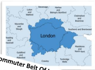
The Commuter Belt Of London!

Otford is in Kent, South East of England. It is quite near to Sevenoaks and is nestled in the middle of the small villages, Shoreham and Kemsing. This big village used to be as small as only a few cute 'lil' houses! Otford is in the commuter belt which means that it is very easy to get into Central London.