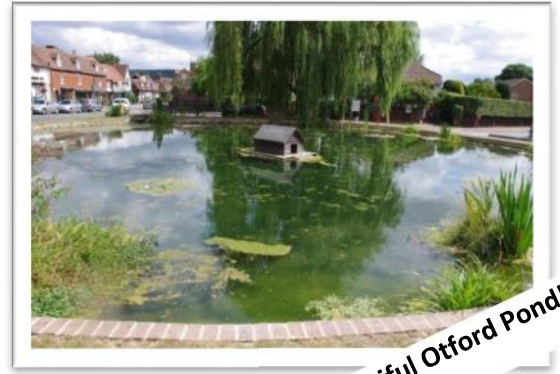
The Beautiful Otford Pond!

Firstly, Otford is a very friendly and warm area to live in. The pretty pond, which is circled by old weeping willow trees, is thought to date back to Anglo Saxon times when it was possibly used as local livestock water.